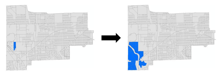
EXISTING RE AND PROPOSED RA-1

This change will consolidate redundant large-lot, primarily single-family residential districts. Only 31 properties in the entire city are currently zoned RE. All 31 properties conform with RA-1 zoning regulations. Merging the RE properties into the RA-1 district promotes a cleaner, more efficient code.