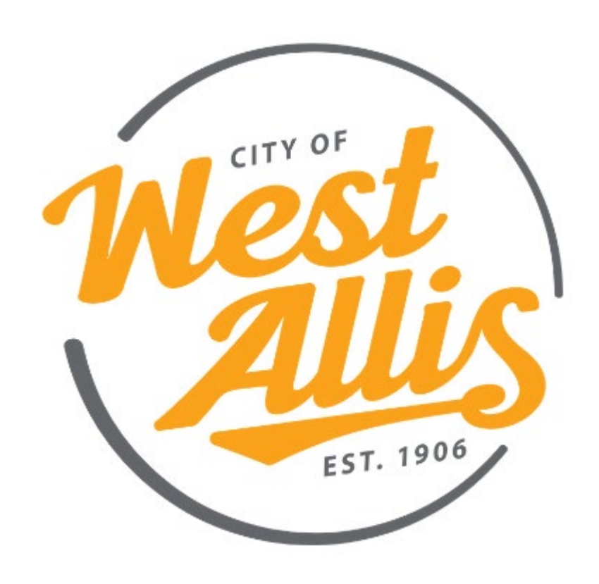
Chapter 12 Zoning and City Planning Subchapter I Zoning Code

Prepared by the Planning & Zoning Office