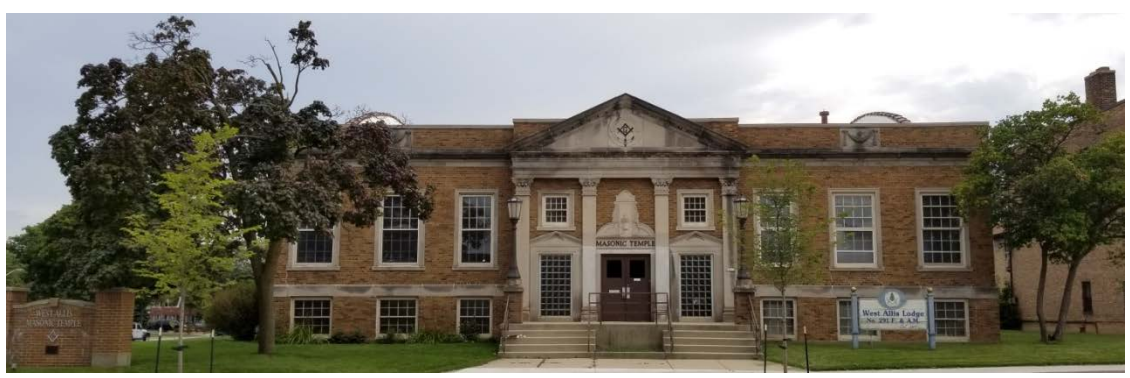
on September 25, 2019.

The Lifeway Church, located at the former Masonic Temple at 7515 W. National Ave. is requesting a one-year extension of time to complete their Site, Landscaping, and Architectural updates with minor alterations that were approved by the Plan Commission