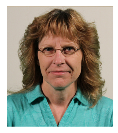
Denise Cleary Communications