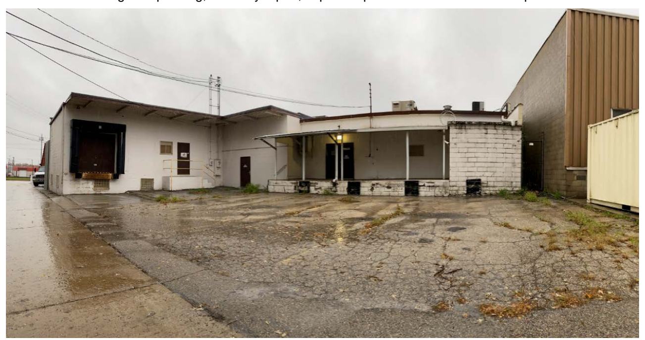
Above is the view from the alley (rear of building).

Amerigraphics has no plans for any architectural or structural alterations to either the exterior or interior of the building, but they do plan to address some exterior maintenance fixes including tuck pointing, masonry repair, asphalt repair and overall clean site up.