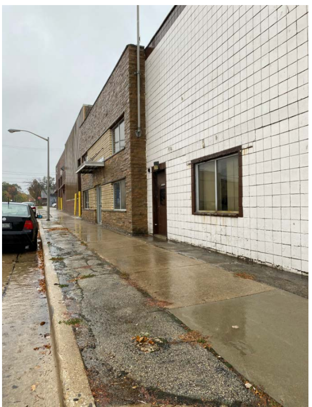
Above - Along S. 54 St. existing asphalt terrace conditions