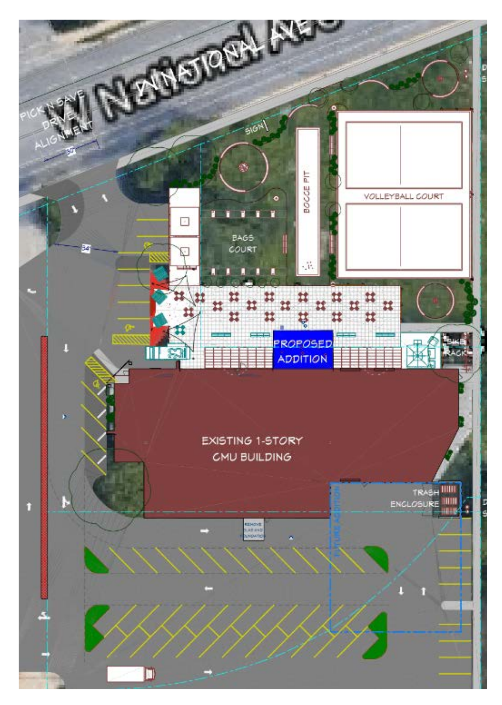
<u>Parking</u> – Per zoning code Chapter 12.19, the assembly areas like tap rooms/taverns and restaurants are required to provide 1 off-street parking space per 150 square feet of gross floor area. Brewery production areas may be considered at one parking space for every 1,500-sf of floor area. The current site plan shows about 57 parking spaces, but there is also the potential for more off-street parking that could be created to the south (undeveloped CDA lands).

The timing of future shared parking on CDA lands is unknown at this time, but would evolve as an eventual redevelopment of the 6771 W. National Ave. property (former