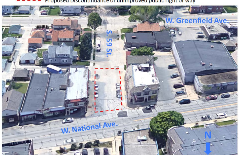
---- Proposed Discontinuance of unimproved public right of way

State Statutes requires publishing a class 3 notice and personal service on abutting landowners at least 40 days before a public hearing (to be March 3) or, if they can't be personally served, the notice needs to be mailed to them at least 30 days ahead of time. Any abutting owner can object to discontinuance by filing a written objection; it would then take a 2/3 vote by the council to override that objection.