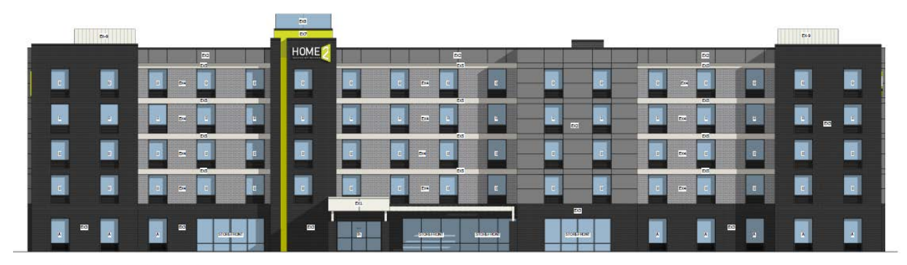
WEST BUILDING ELEVATION

Staff recommends additional windows be included on the north and south elevations, as well as to the pool area on the building's east side, to be consistent with the previously approved plans.