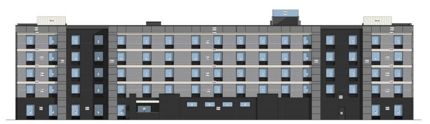
EAST BUILDING ELEVATION