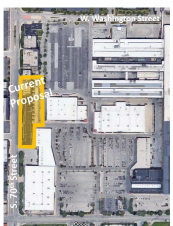
West Quarter Concept Master Plan