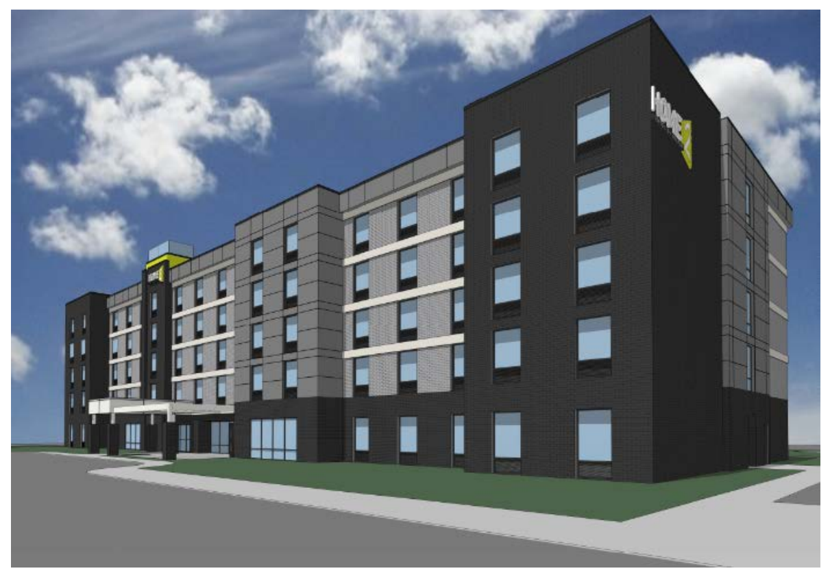
View from southeast corner

The proposed Home2 Suites hotel is 5 stories tall and includes 128 guest rooms, a meeting room, an indoor pool, a fitness room, and outdoor seating areas. The building area is 77,469 square feet and, while the height of the roofline varies slightly, the building is approximately 53 feet tall.