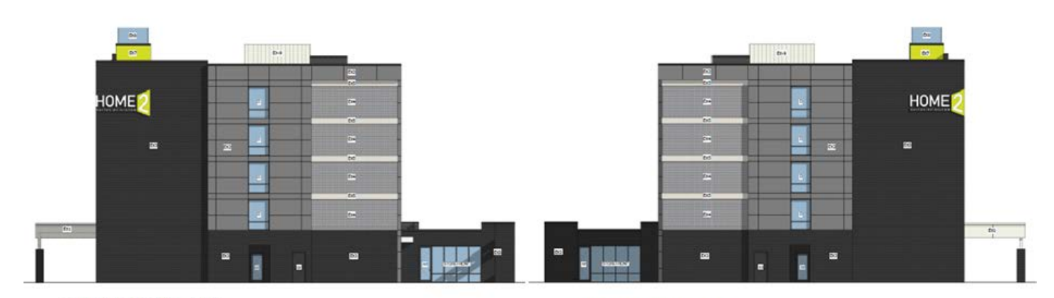
5 SOUTH BUILDING ELEVATION