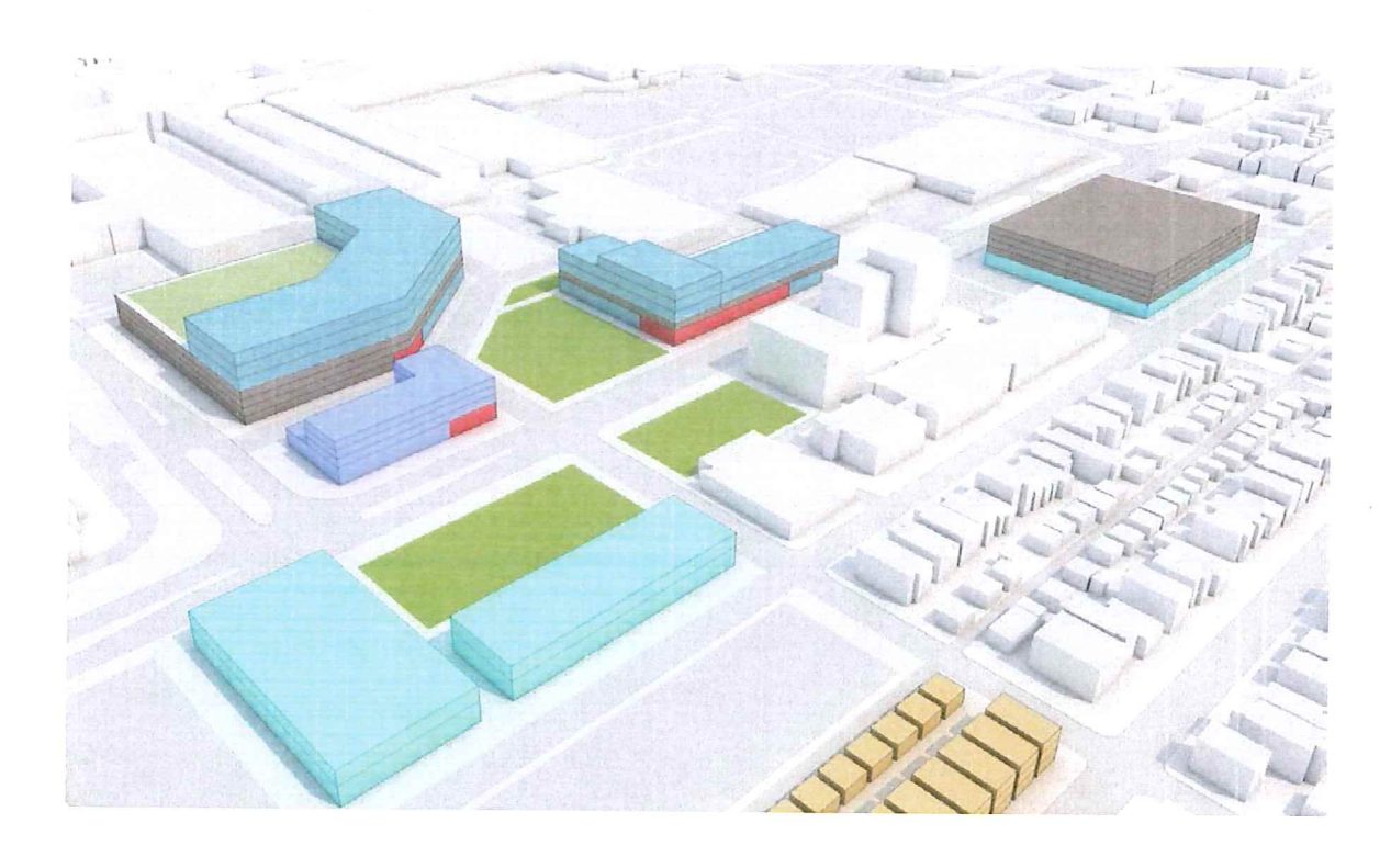
EXHIBIT B Preliminary Development Plan