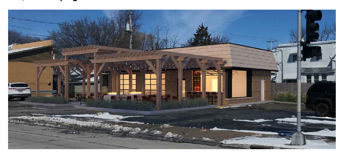
Site, Landscaping and Architectural Plans

The building's interior will be reconfigured to accommodate customer seating and a bar, and to provide for the necessary mechanical and restroom upgrades. A 1,300 square foot concrete patio will be installed in front of the existing building, which will include outdoor seating, fire pits, planters, and an overhead pergola. The pergola will be made of cedar and range in height from approximately 10.5 feet to 14 feet. The existing garage doors will be replaced with decorative glass garage doors, approximately 9 feet tall. Both store front windows will be replaced – one with a similar, upgraded storefront window and the other with a half garage door style roll up window, which will allow for seating at an outdoor bar. Staff recommends the existing roof be painted prior to the installation of the pergola.