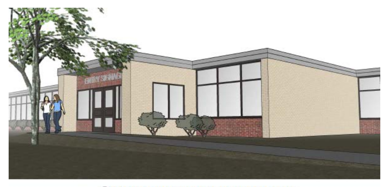
4 VIEW OF NEW ENTRY VESTIBULE FROM S.E.

Recommendation: Recommend approval of the Site, Landscaping and Architectural Plans for Irving Elementary School, an existing elementary school, located at 10230 W. Grant St., submitted by CG Schmidt on behalf of West Allis-West Milwaukee School District (Tax Key No. 480-9969-000).