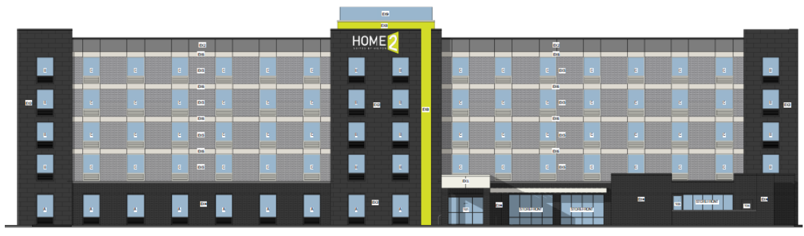
TEAST BUILDING ELEVATION

will be equipped with PTAC (packaged terminal air conditioners) located below the windows. Their exterior grilles will be built into the window framing system and finished to match the surrounding materials.