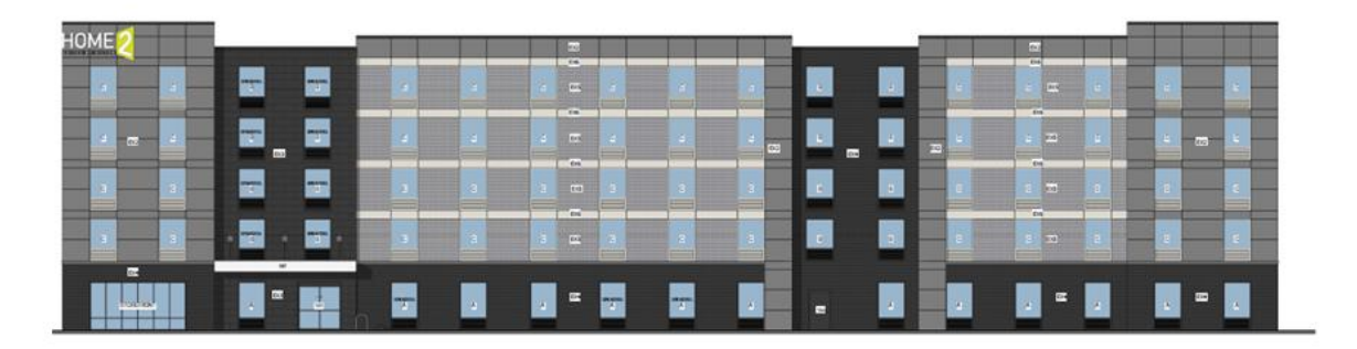
WEST BUILDING ELEVATION

Vehicle access to the hotel will be available from two newly constructed roadways, one to the east and one the south of the building. Pedestrians may also access the building from the west side on S. 70<sup>th</sup> Street. For the near future, hotel parking will be located in a lot across the street from the main entrance. The long-term vision for the West Quarter development involves eventually converting this parking area, as well as surrounding parking areas, to a mixed-use building, inclusive of offices and a parking garage.