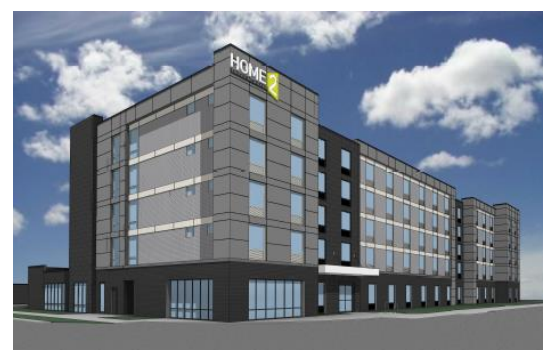
View from northwest corner

Building materials will be comprised primarily of vintage black brick around the base, a series of full-height metal panel proportions (matching the vintage black brick), sterling white brick, and pewter siding. Additionally, the Home2 Suites beacon, which indicates the building's main entrance on the east side, will be made with laminated, heat-treated glass in shades of blue and green.