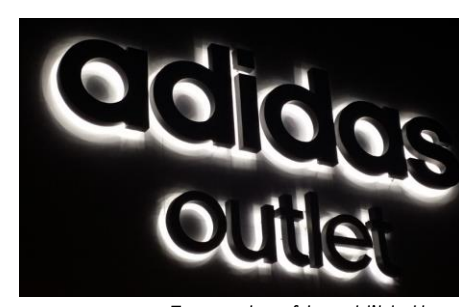
Example of backlit letters

New matching windows will replace the glass block windows on the front of the building. The soffits on either end of the fascia are being repaired. Old wood will be removed and replaced to match the existing fascia. Fascia will be power washed and cleaned before installing new signage. The new sign will be an approx. 44 square foot sign with black backlit letters with and a flickering red flame.