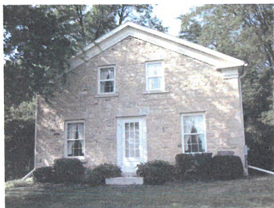
Jonathan Clark House Museum