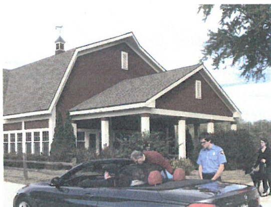
MCF Road Rally at Sommer Pavilion

Since 1999, over $750,000 has been granted to support many local projects.