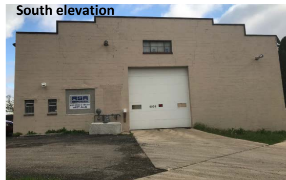
RSR - 6036 W. Beloit Rd Tax Key No. 475-0034-004

RSR would like to obtain an occupancy permit, but cannot until Planning, Building Inspections and Plumbing issues have been resolved. The special use and plan approval has since expired and the applicant has reapplied for a special use and site, landscaping and architectural plan review.