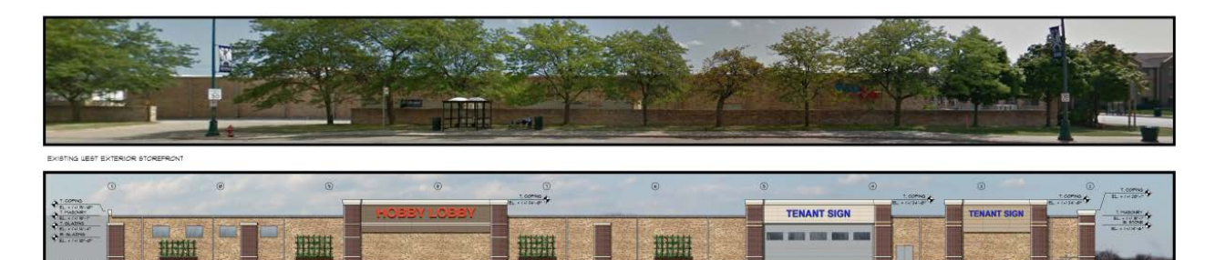
PROPOSED LEST EXTERIOR RENDERING

The new internal loading dock area is proposed would also house any future refuse areas or compactor areas, so as to be out of view as located inside the building.