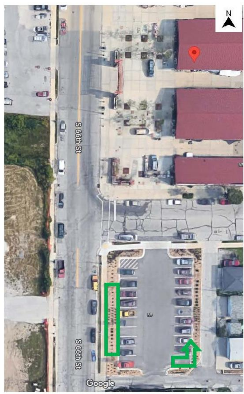
EXHIBIT C MAP SHOWING THE GREEN INFRASTRUCTCURE SUBJECT TO THIS EASEMENT

Approximate Location of Green Infrastructure