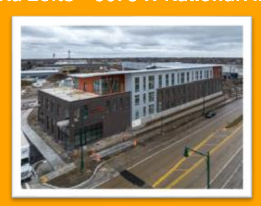
Former Tenaxol – 5801 W National Ave