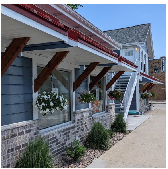
iii. Integrating awnings, stairwells, and other exterior features into the design adds depth and leads to a more coherent and pleasing appearance.