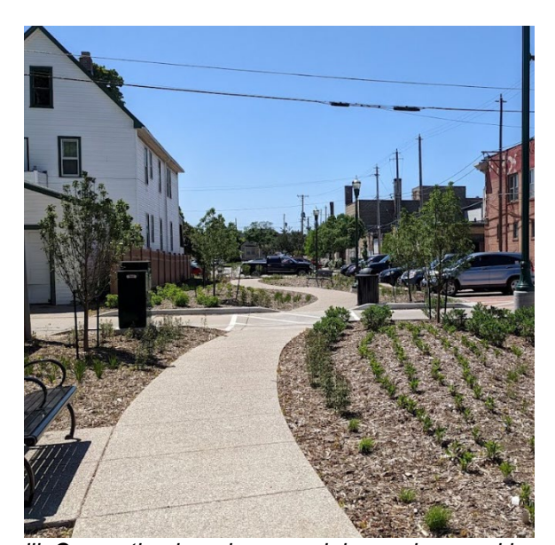
iii. Converting largely unused, impervious parking spaces into a green space with walkways and seating transforms an underwhelming site into an inviting place where people are encouraged to spend time and plants can thrive.