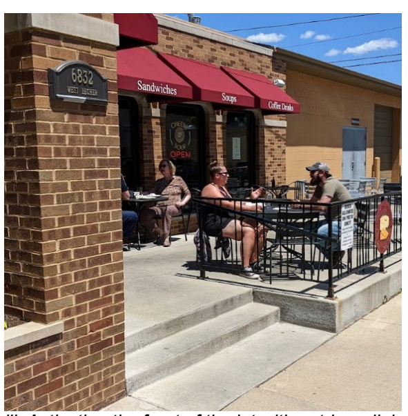
iii. Activating the front of the lot with outdoor dining adds to a compelling, vibrant streetscape.