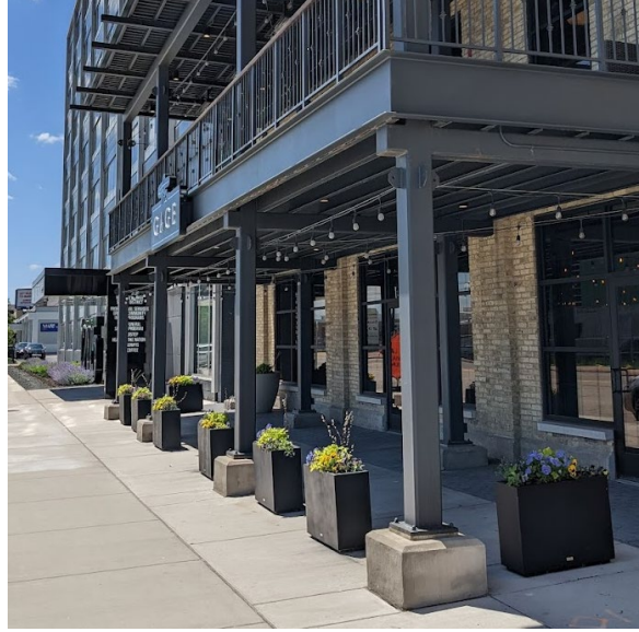
iv. This balcony addition references the historic industrial feel of the building while playing on the complementary colors of a neighboring building.

"Be open to innovation and creativity. Don't make everything look similar."