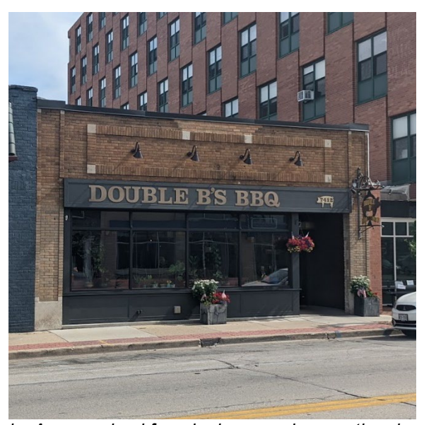
iv. An organized façade, large and proportional windows, and a strong palette of materials and textures forms the basis for a harmonious design that is attractive and functional.

"West Allis needs buildings that will stand the test of time - we have many historic buildings in our city that people enjoy today, new buildings should also be designed with this level of quality so that they will be loved in the future."