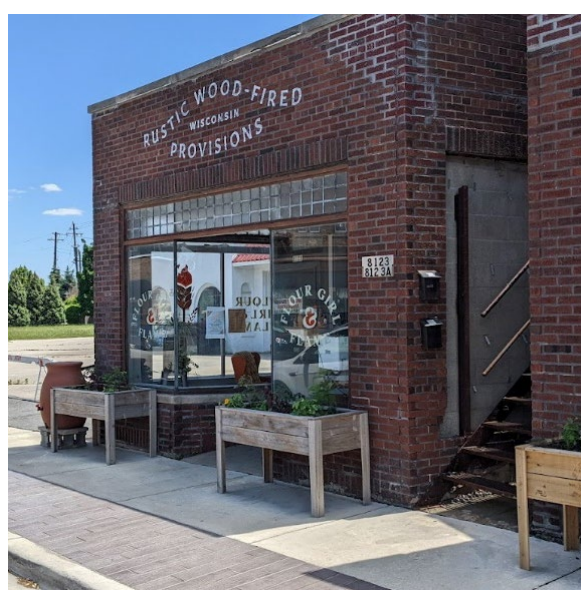
i. Tall ground floors with large, clear windows invite passerby to look inside. Planters blend the distinction between sidewalk and building.