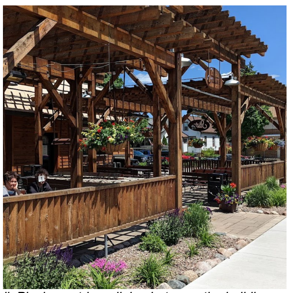
ii. Placing outdoor dining between the building and sidewalk ensures it will be seen and used. Pergolas provide enclosure and shade, and firepits allow spaces to be used year-round.