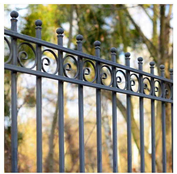
iv. Ornamental metal fencing delineates spaces in an attractive manner and adds character to a place, which is particularly beneficial along street frontages.

85% of survey respondents preferred ornamental metal fencing styles over chain link or wooden fencing