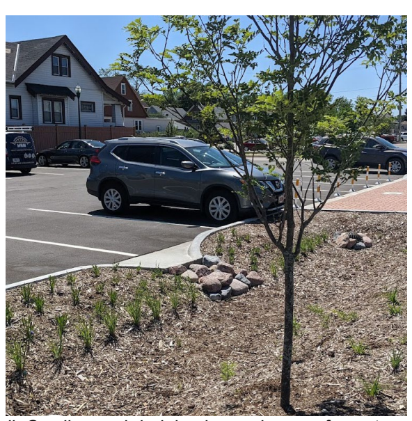
ii. Grading and draining impervious surfaces to bioswales and rain gardens filled with native plantings absorbs stormwater at the source, preventing runoff, pollution, and flooding downstream.