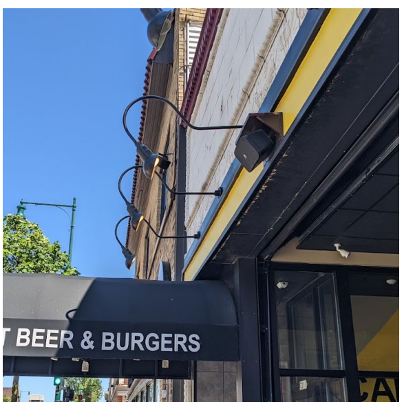
iii. Shielding lighting from public view highlights building features and signage while limiting glare to the sidewalk and neighbors.