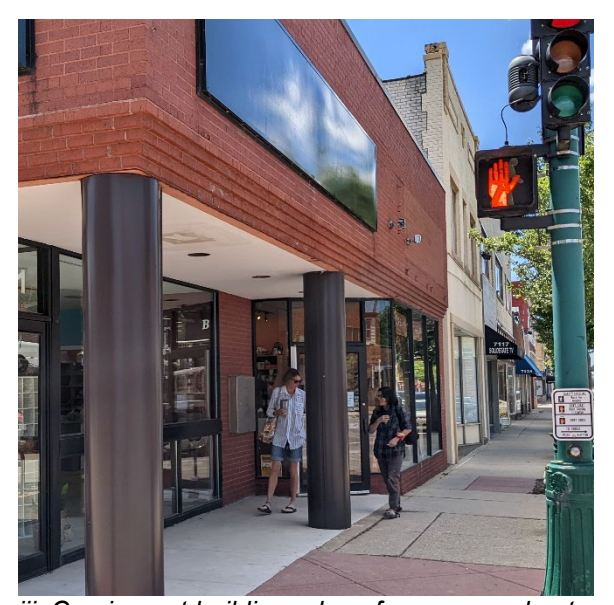
iii. Carving out building edges for a covered entry smooths the transition between the public and private realm, expands the sidewalk, provides weather protection and space for patrons to collect themselves.