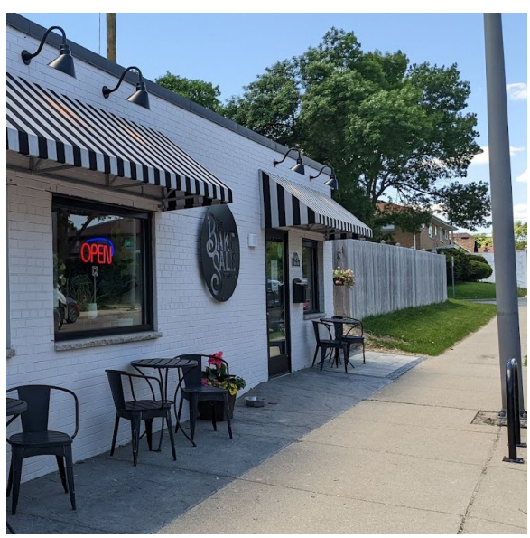
i. Orienting towards the street frontage enables an active streetscape and sense of place.