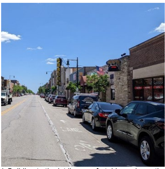
i. Building to the lot line comfortably encloses the space around the street. The area is dense and walkable with many destinations in arm's reach. Buildings on small lots with a variety of façade designs and signage add rhythm and interest.