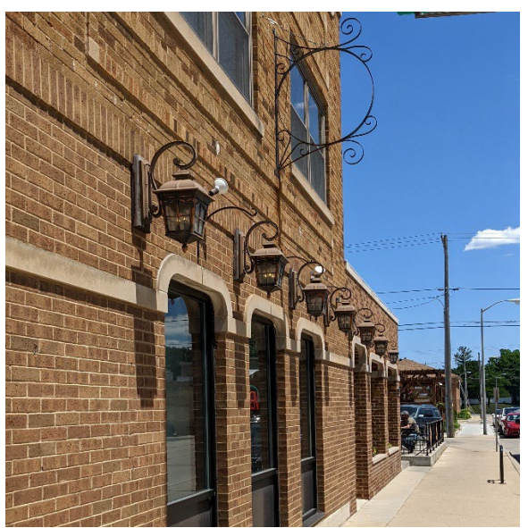
iii. Retaining historic features like the lights and original sign frame lend a historic feel to this building.