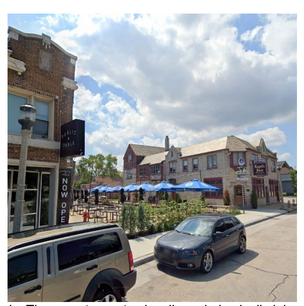
iv. These restaurants visually and physically join their sites by creating a shared outdoor dining space.

"Things on the same block should have a sense of unison to make it seem more welcoming and collective ."