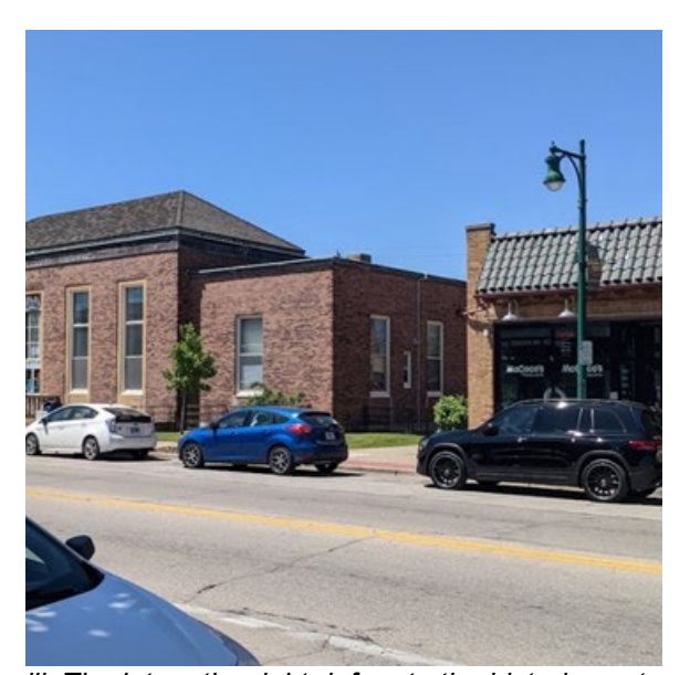
iii. The lot on the right defers to the historic post office by giving a wide berth with generous side setback and by limiting its height. It also uses brick, a defining feature of buildings in the area.