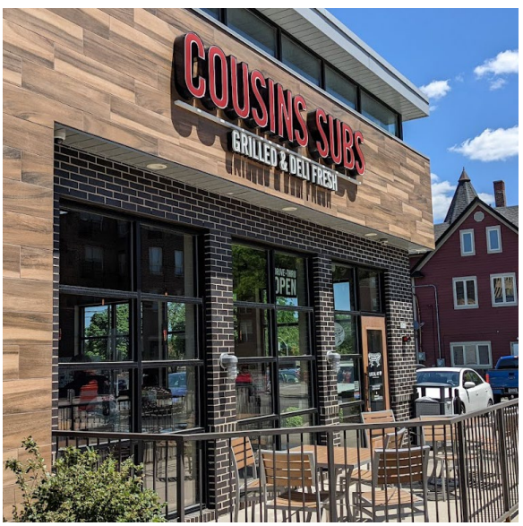
i. Using enduring materials like brick masonry, decorative concrete (in this example stylized as wood), and metal features ensures a building will age well and enhances the community's image.