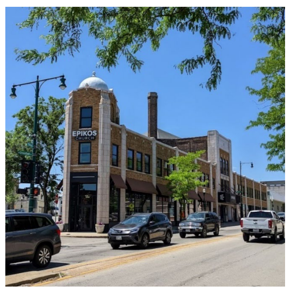
ii. This unique building responds to the corner lot by filling out the site while increasing massing and incorporating an entrance at the corner.