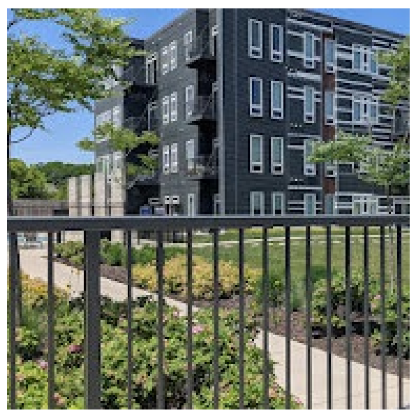
iv. Providing internal pathways with ample landscaping connects users to amenities and each other while creating functional, interesting spaces to move through and spend time.

"More public, car-free spaces like the one between Public Table and [Kegel's Inn]!"