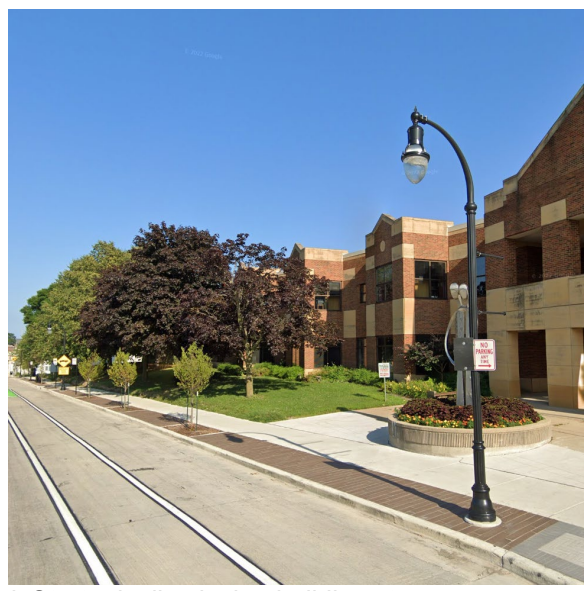
i. Strategically placing buildings to preserve existing trees and incorporating green spaces into the site design generates opportunities for respite from the urban environment, sequesters carbon, and respects existing life.