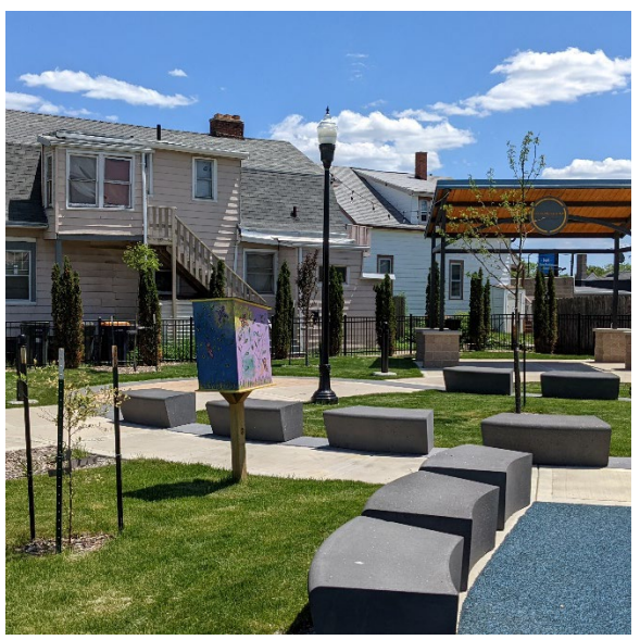
i. Including plentiful and unique seating opportunities, natural features, and a variety of opportunities for engagement encourages people to spend time in a space.