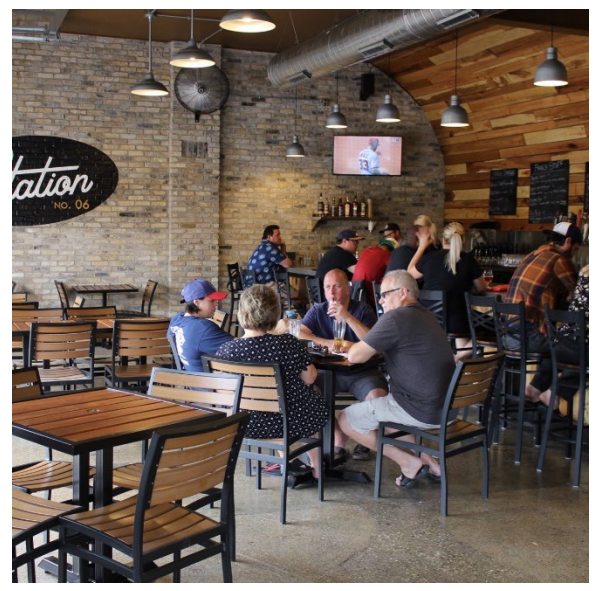
iv. Adapting an underutilized building for reuse reduces waste and pollution associated with demolition and construction and generates opportunities for creative, compelling spaces.

"We need more parks, trees, green roofs, and gardens to offset rising temperatures in the city."