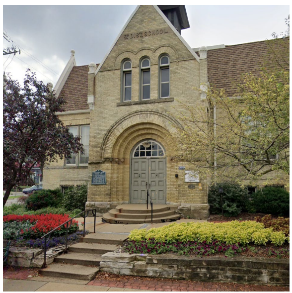
ii. Incorporating detail and craftsmanship at the ground floor and increasing texture and visual interest surrounding the entrance enhances the human-scale experience of the building.