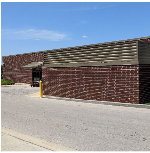
ii. Screening refuse containers within an alcove designed in concert with the materials of the building minimizes its impact.