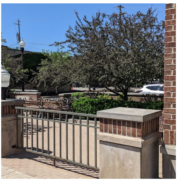
i. Buffering side vehicle parking from the sidewalk with a public gathering space, including benches and trees, adds to the public realm rather than detracting from it.