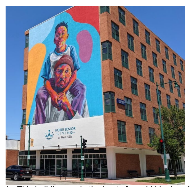
iv. This building made the best of an old blank wall facing the street by adding a large mural.

What do you like about the design of your favorite building in West Allis?