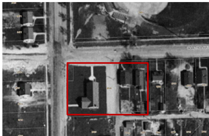
1951 aerial view (link: MC LIS)

Trinity Lutheran was formed in 1942 in the former Fairview public school (on the current site of WAWM Recreation Department immediately north). In 1947 Trinity purchased and built upon lands just south of W. Arthur Ave. on what is now their current location at 2500 S. 68 St. Subsequent church expansion in the 1950's and the integration of a Sunday school program in 1966 offered 27 different classes. In 1970, Trinity broke ground on a school addition for new school/classroom space which was opened a year later and the school encompassed grades Kindergarten through first grades.