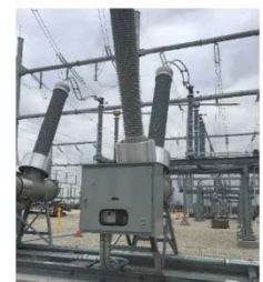
Breakers are 16ft tall, but much more numerous