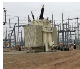
Transformers are over 20ft tall