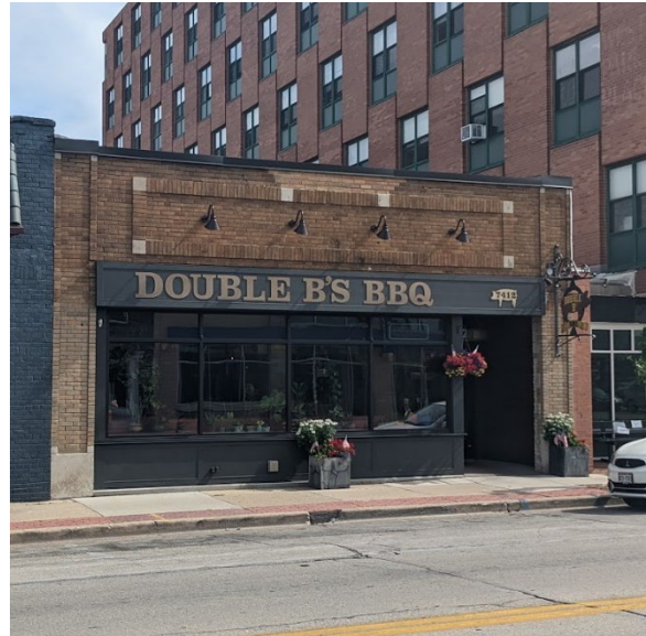
iv. An organized façade, large and proportional windows, and a strong palette of materials and textures forms the basis for a harmonious design that is attractive and functional.

“West Allis needs buildings that will stand the test of time - we have many historic buildings in our city that people enjoy today, new buildings should also be designed with this level of quality so that they will be loved in the future.”