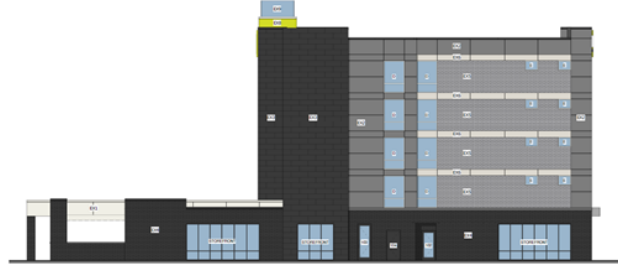
NORTH BUILDING ELEVATION