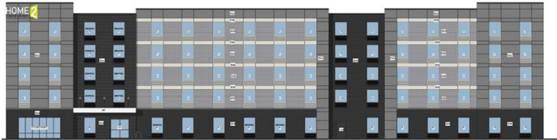
WEST BUILDING ELEVATION

Vehicle access to the hotel will be available from two newly constructed roadways, one to the east and one the south of the building. Pedestrians may also access the building from the west side on S. 70 th Street. For the near future, hotel parking will be located in a lot across the street from the main entrance. The long-term vision for the West Quarter development involves eventually converting this parking area, as well as surrounding parking areas, to a mixed-use building, inclusive of offices and a parking garage.