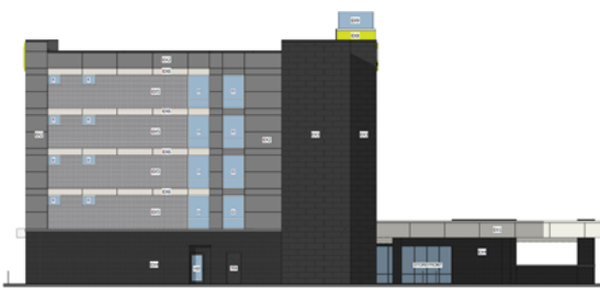
SOUTH BUILDING ELEVATION