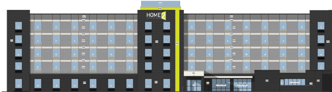
EAST BUILDING ELEVATION

will be equipped with PTAC (packaged terminal air conditioners) located below the windows. Their exterior grilles will be built into the window framing system and finished to match the surrounding materials.