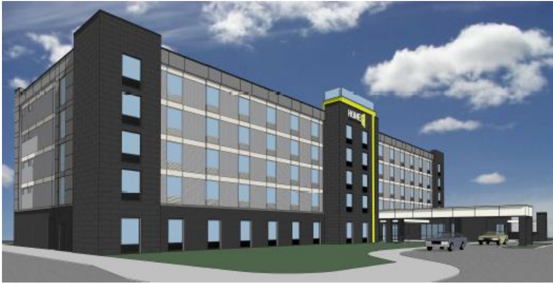
View from southeast corner

The main hotel entrance will be located on the building's east side, where an existing private drive will be reconstructed and widened to include a covered drop-off area and delineated pedestrian crossing areas.