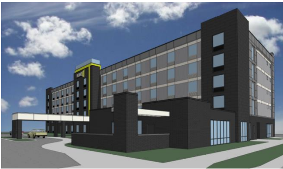
View from northeast corner

An indoor pool, including the associated outdoor seating area, will be located at the building's northeast corner on the first floor. A fitness room, also on the ground floor, will be located on the northwest corner of 70 th and Washington, complete with storefront windows. A pedestrian entrance is also proposed on the building's west side, on S. 70 th Street.