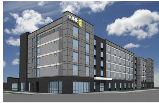
View from northwest corner

Building materials will be comprised primarily of vintage black brick around the base, a series of full-height metal panel proportions (matching the vintage black brick), sterling white brick, and pewter siding. Additionally, the Home2 Suites beacon, which indicates the building's main entrance on the east side, will be made with laminated, heat-treated glass in shades of blue and green.