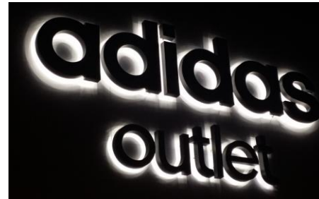
Example of backlit letters

New matching windows will replace the glass block windows on the front of the building. The soffits on either end of the fascia are being repaired. Old wood will be removed and replaced to match the existing fascia. Fascia will be power washed and cleaned before installing new signage. The new sign will be an approx. 44 square foot sign with black backlit letters with and a flickering red flame.