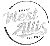
EXHIBIT 1 CITY OF WEST ALLIS ECONOMIC DEVELOPMENT LOANS GENERAL CONDITIONS (EQUIPMENT)

BORROWER: Bad Charlie LLC COMMITMENT: December 15, 2020 October 16, 2020 LOAN AMOUNT: $100,000