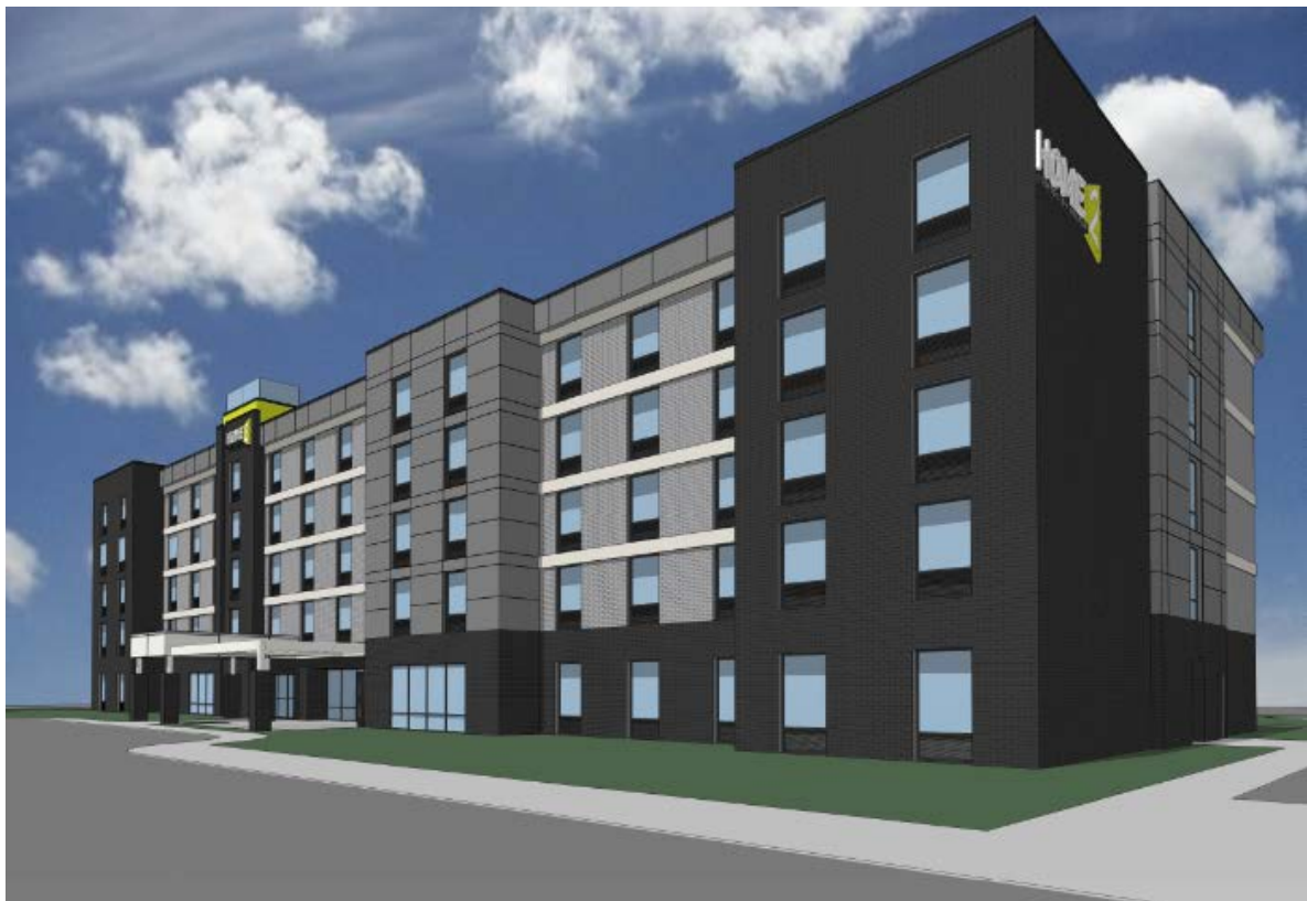
View from southeast corner

The proposed Home2 Suites hotel is 5 stories tall and includes 128 guest rooms, a meeting room, an indoor pool, a fitness room, and outdoor seating areas. The building area is 77,469 square feet and, while the height of the roofline varies slightly, the building is approximately 53 feet tall.