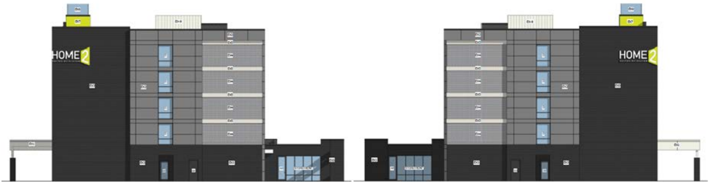
SOUTH BUILDING ELEVATION