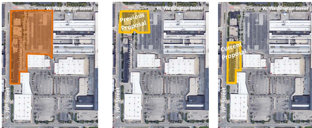
West Quarter Concept Master Plan

In the previously approved proposal, the hotel was located on the north end of the parcel. In this revised proposal, the hotel is planned for the southern portion of the property. The shift allows the more visible corner lot to remain available for a future mixed-use office and commercial development.