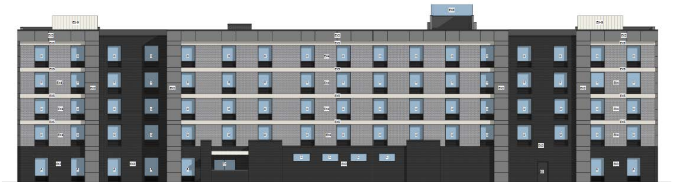
EAST BUILDING ELEVATION