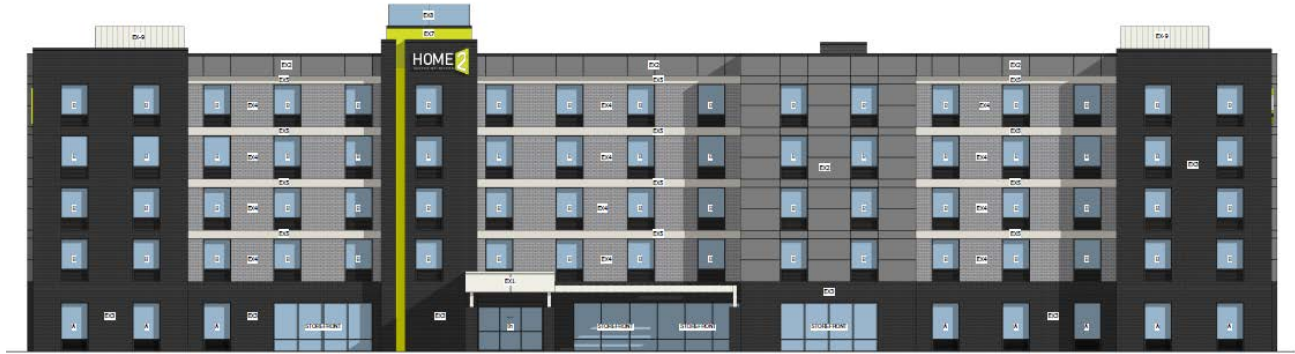
WEST BUILDING ELEVATION

Staff recommends additional windows be included on the north and south elevations, as well as to the pool area on the building's east side, to be consistent with the previously approved plans.