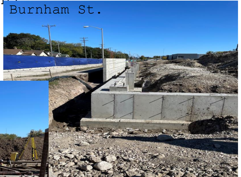
Looking east along W. Burnham St.