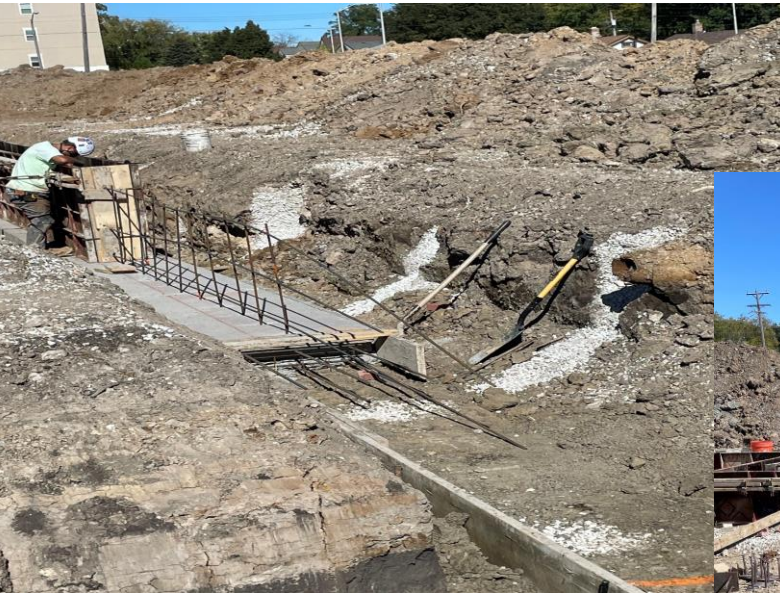
Looking north along S. 53 rd St.