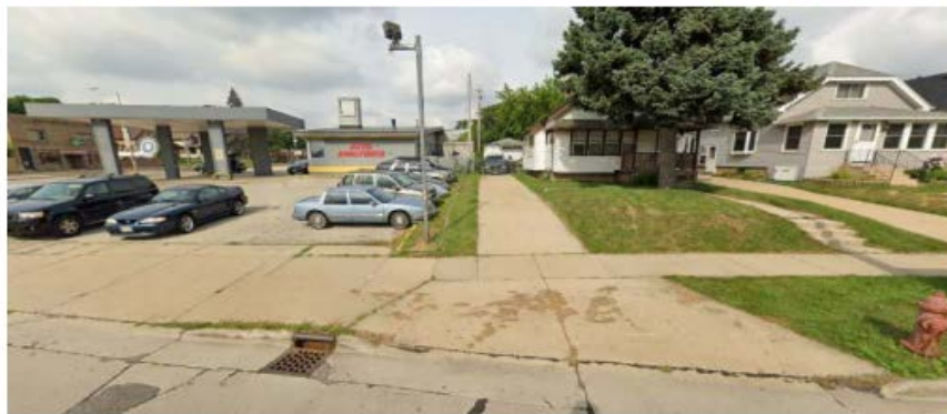
2021 proposed south elevation and existing street view from S. 84 St.