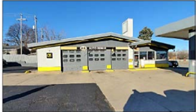
Existing building (south elevation)

Since this time the subject properties at 8404 W. Greenfield Ave. and 1359 S. 84 St. have been combined via certified survey map and the overall property is zoned C-2, neighborhood commercial district.