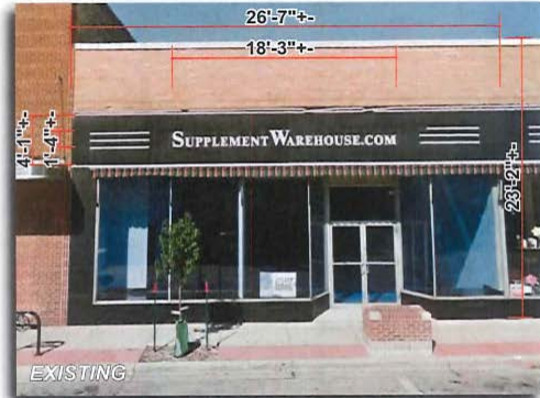
South Building Elevation - Before

Recommendation: Plan Commission approval of the Signage Plan Appeal for B&K/Supplement Warehouse located at 7100-7110 W. Greenfield Ave. submitted by Chris Cronin of JNB Signs, Inc. (Tax Key No. 440-0314-000)