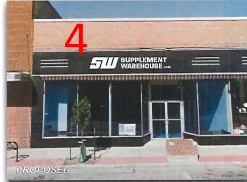
South Building Elevation - AFTER