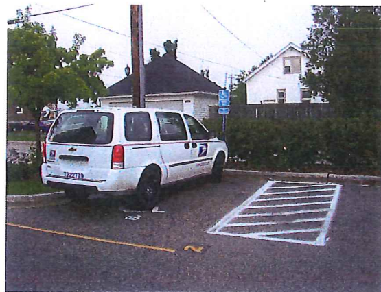
HC parking space