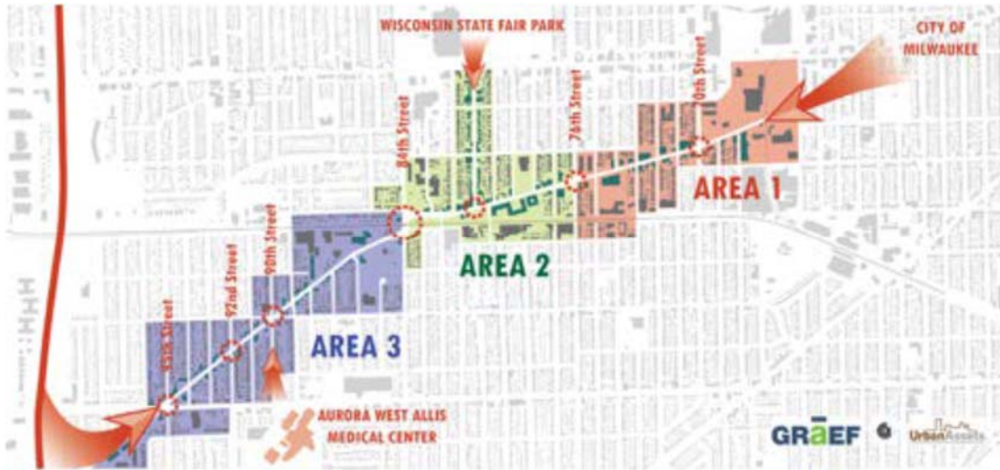
Exhibit A – National Avenue Corridor Map