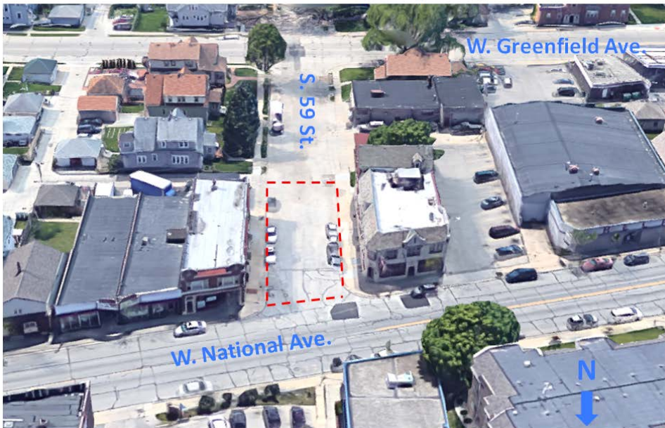
----- Proposed Discontinuance of unimproved public right of way

Should the Council vacate this portion of street, the abutting property owners would receive their abutting portion of land.