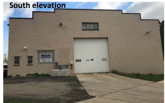
RSR - 6036 W. Beloit Rd Tax Key No. 475-0034-004