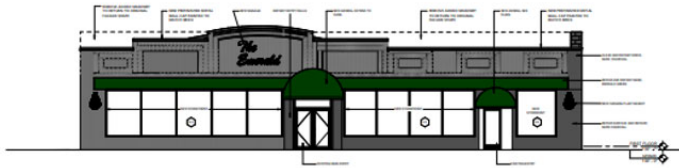
2 SOUTH ELEVATION - PROPOSED