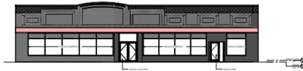
1 SOUTH ELEVATION - EXISTING

PROJECT THE EMERALD 7540-46 GREENFIELD AVE WEST ALFA, WISCONSIN