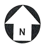
EXHIBIT "A" NOT TO SCALE

All dimensions and bearings relate to the centerline of easement.