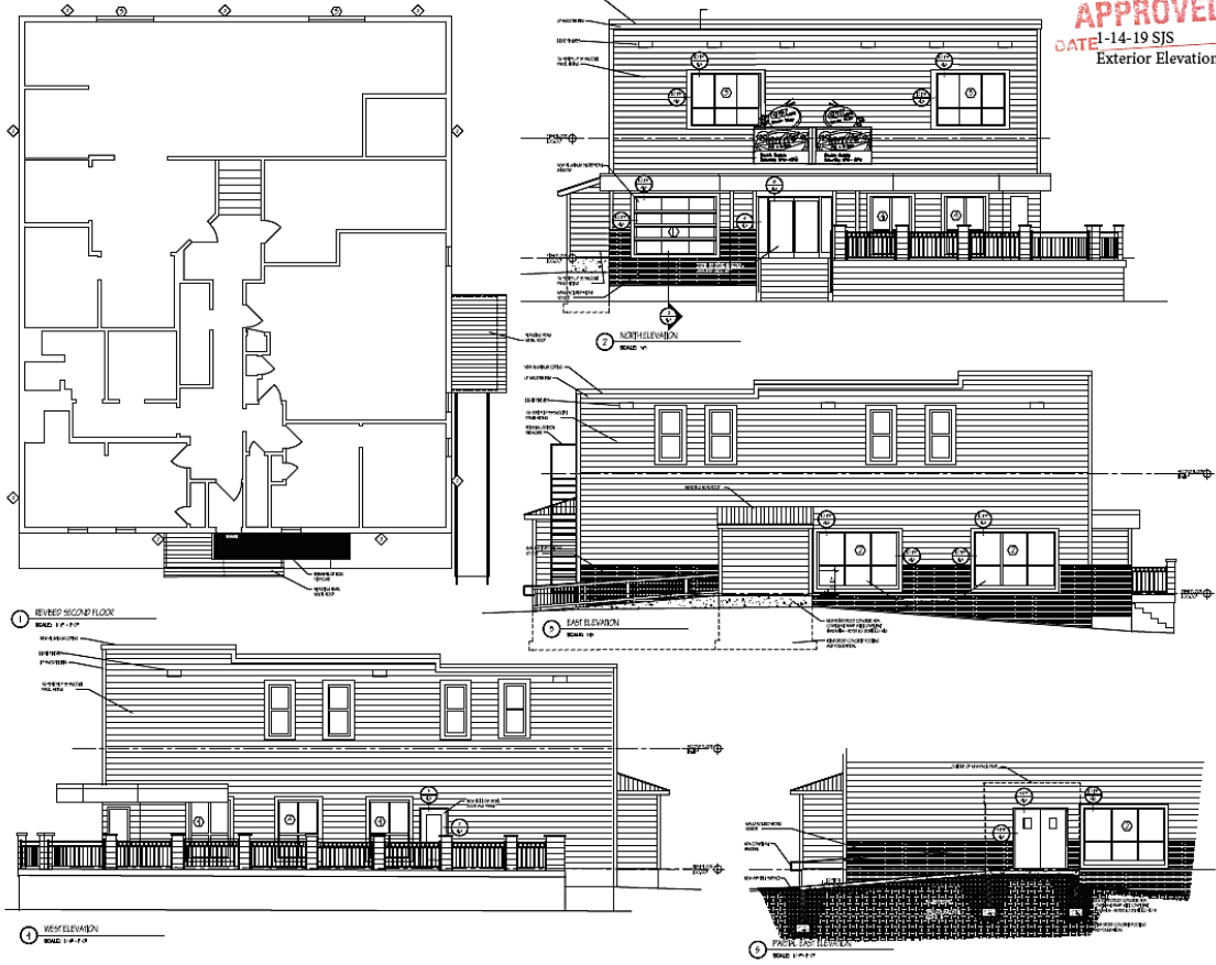
Before Remodel – front entrance/north elevation 8031 W Greenfield Ave.