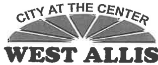
Exhibit D and E