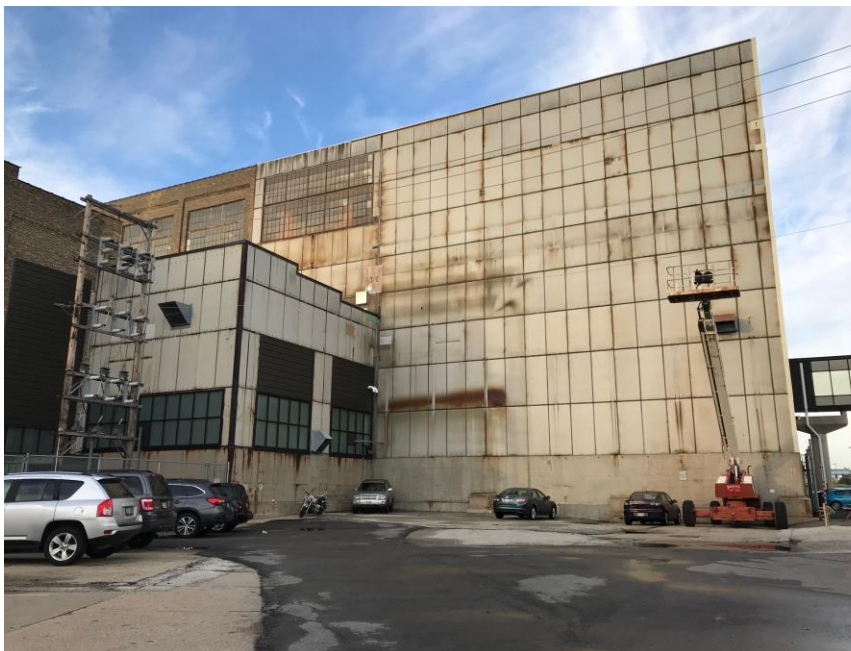
View of existing building where proposed addition to be located.