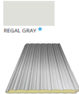
Paint and material samples.