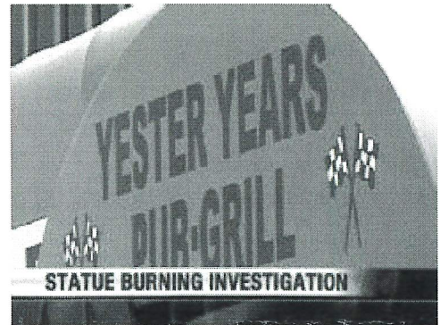
Video: Obama Effigy Burned In Wis. Bar