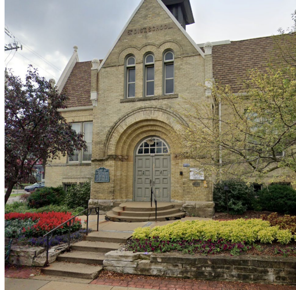
ii. Incorporating detail and craftsmanship at the ground floor and increasing texture and visual interest surrounding the entrance enhances the human-scale experience of the building.