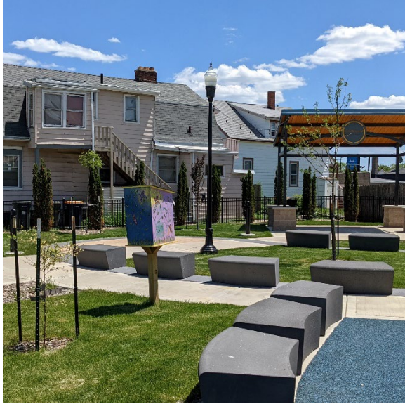
i. Including plentiful and unique seating opportunities, natural features, and a variety of opportunities for engagement encourages people to spend time in a space.