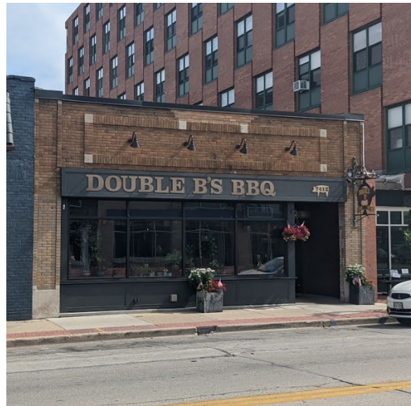
iv. An organized façade, large and proportional windows, and a strong palette of materials and textures forms the basis for a harmonious design that is attractive and functional.

“West Allis needs buildings that will stand the test of time - we have many historic buildings in our city that people enjoy today, new buildings should also be designed with this level of quality so that they will be loved in the future.”