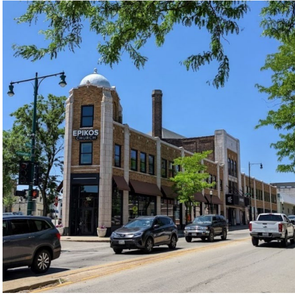
ii. This unique building responds to the corner lot by filling out the site while increasing massing and incorporating an entrance at the corner.