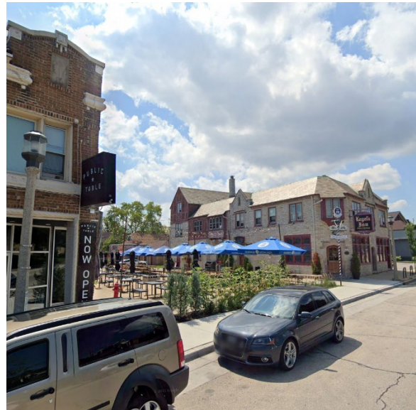
iv. These restaurants visually and physically join their sites by creating a shared outdoor dining space.

“Things on the same block should have a sense of unison to make it seem more welcoming and collective.” – West Allis resident