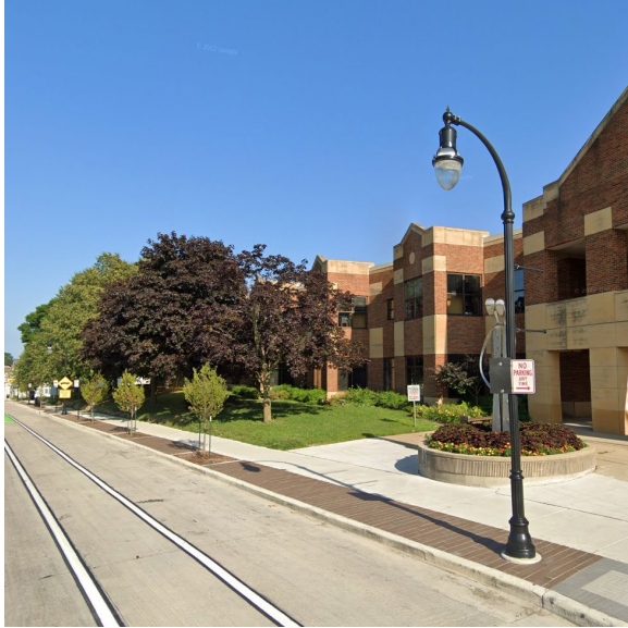
i. Strategically placing buildings to preserve existing trees and incorporating green spaces into the site design generates opportunities for respite from the urban environment, sequesters carbon, and respects existing life.