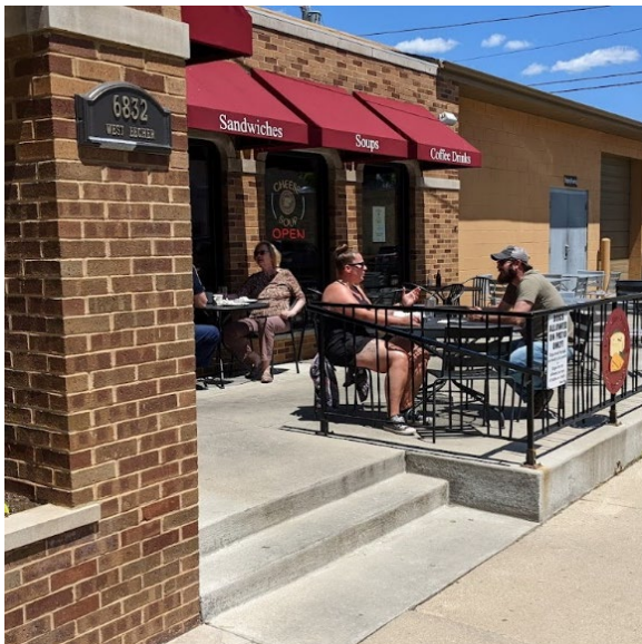
iii. Activating the front of the lot with outdoor dining adds to a compelling, vibrant streetscape.