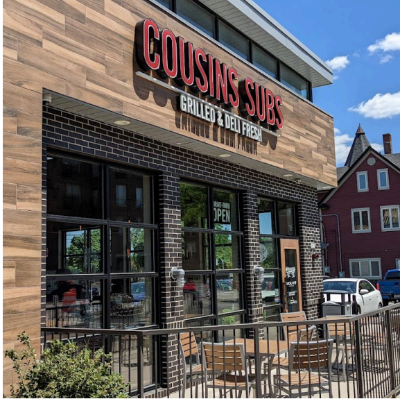
i. Using enduring materials like brick masonry, decorative concrete (in this example stylized as wood), and metal features ensures a building will age well and enhances the community's image.