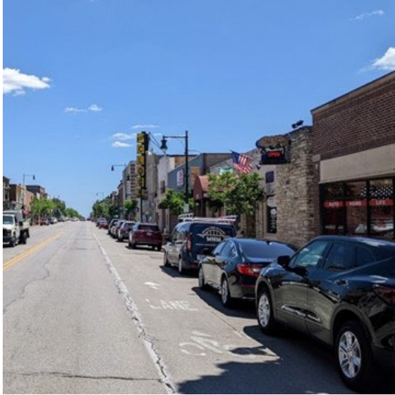
i. Building to the lot line comfortably encloses the space around the street. The area is dense and walkable with many destinations in arm's reach. Buildings on small lots with a variety of façade designs and signage add rhythm and interest.