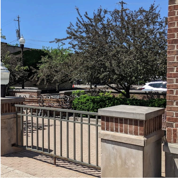
i. Buffering side vehicle parking from the sidewalk with a public gathering space, including benches and trees, adds to the public realm rather than detracting from it.