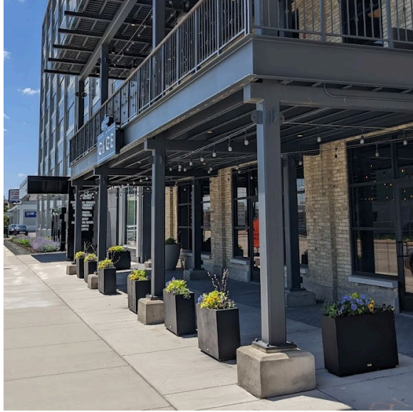
iv. This balcony addition references the historic industrial feel of the building while playing on the complementary colors of a neighboring building.

“Be open to innovation and creativity. Don’t make everything look similar.” – West Allis business owner