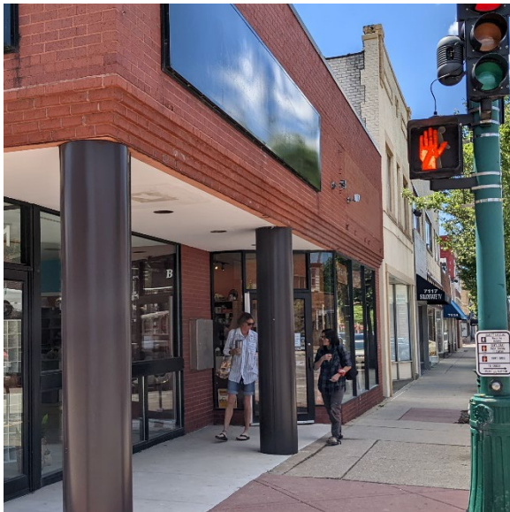
iii. Carving out building edges for a covered entry smooths the transition between the public and private realm, expands the sidewalk, provides weather protection and space for patrons to collect themselves.