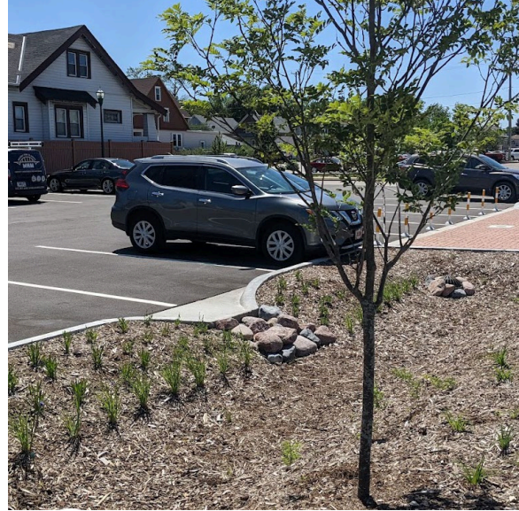
ii. Grading and draining impervious surfaces to bioswales and rain gardens filled with native plantings absorbs stormwater at the source, preventing runoff, pollution, and flooding downstream.