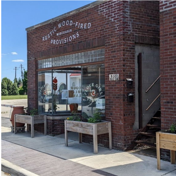
i. Tall ground floors with large, clear windows invite passerby to look inside. Planters blend the distinction between sidewalk and building.