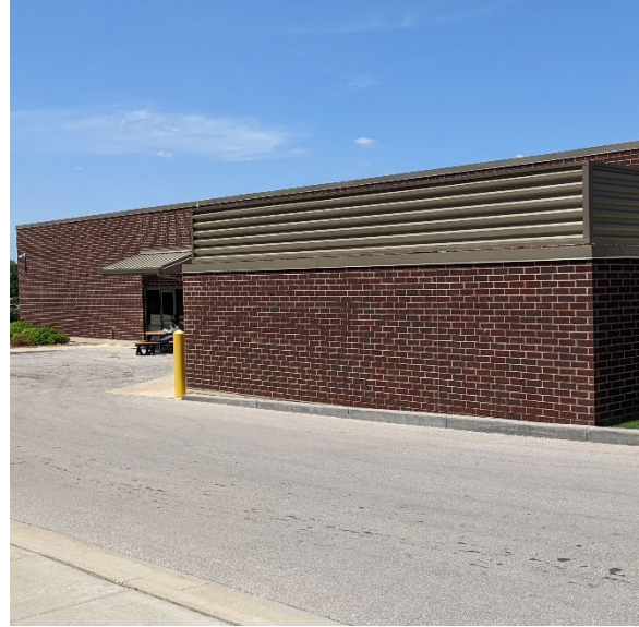
ii. Screening refuse containers within an alcove designed in concert with the materials of the building minimizes its impact.