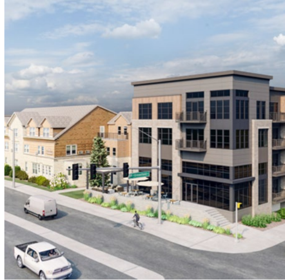
ii. This proposed development concentrates its height and mass next to the main commercial street and corner. It then decreases to 3-stories, then 2-story rowhomes (not pictured) as it moves south towards its residential neighbor.