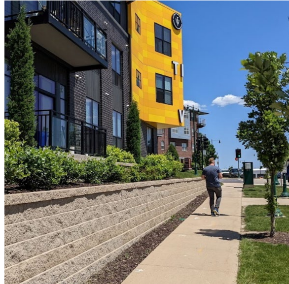
ii. Site grading, landscaping, and semi-private enclosed porches soften the space between the building and sidewalk.