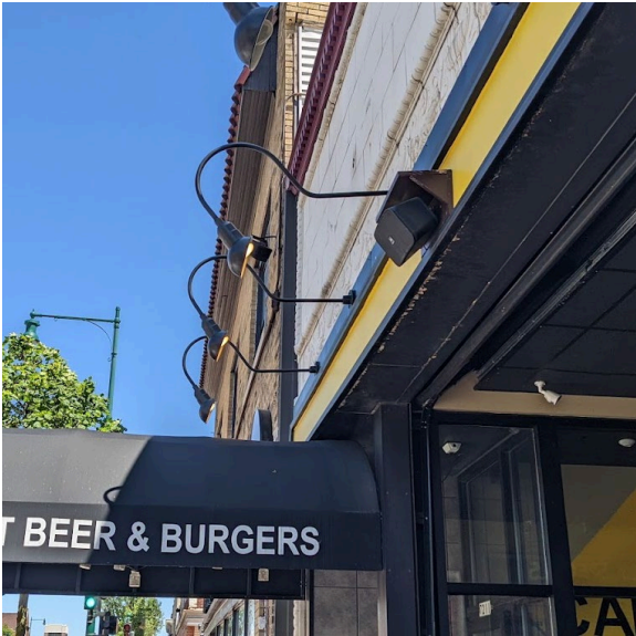
iii. Shielding lighting from public view highlights building features and signage while limiting glare to the sidewalk and neighbors.