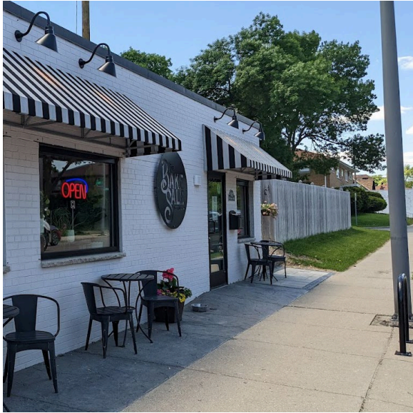
i. Orienting towards the street frontage enables an active streetscape and sense of place.