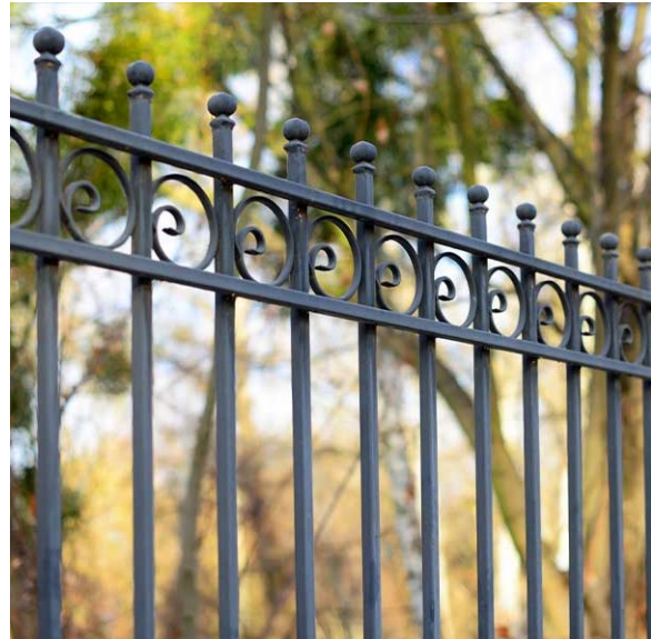
iv. Ornamental metal fencing delineates spaces in an attractive manner and adds character to a place, which is particularly beneficial along street frontages.

85% of survey respondents preferred ornamental metal fencing styles over chain link or wooden fencing