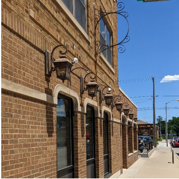
iii. Retaining historic features like the lights and original sign frame lend a historic feel to this building.