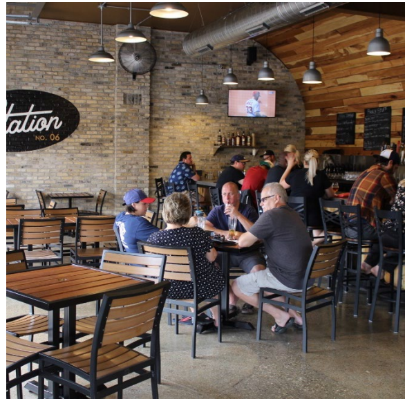
iv. Adapting an underutilized building for reuse reduces waste and pollution associated with demolition and construction and generates opportunities for creative, compelling spaces.

“We need more parks, trees, green roofs, and gardens to offset rising temperatures in the city.” – West Allis property owner