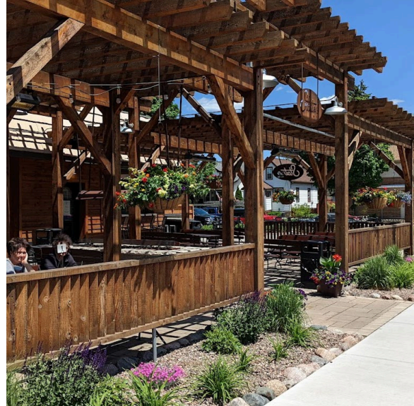
ii. Placing outdoor dining between the building and sidewalk ensures it will be seen and used. Pergolas provide enclosure and shade, and firepits allow spaces to be used year-round.