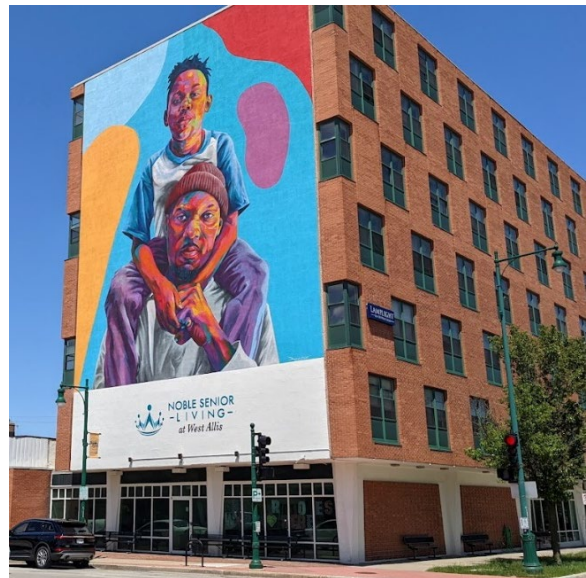
iv. This building made the best of an old blank wall facing the street by adding a large mural.