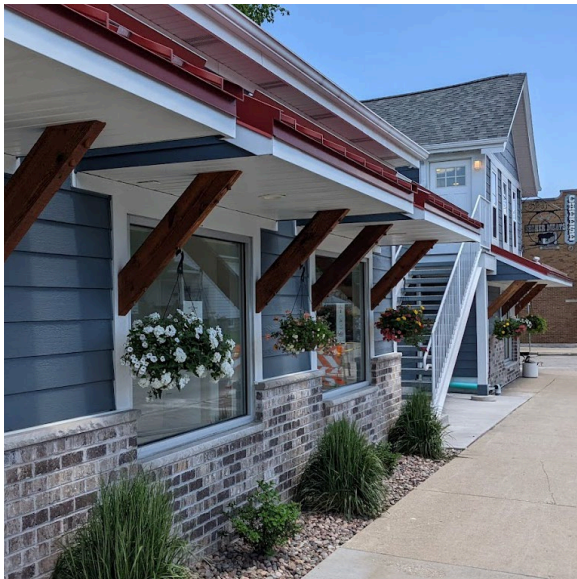
iii. Integrating awnings, stairwells, and other exterior features into the design adds depth and leads to a more coherent and pleasing appearance.