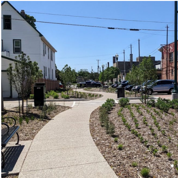
iii. Converting largely unused, impervious parking spaces into a green space with walkways and seating transforms an underwhelming site into an inviting place where people are encouraged to spend time and plants can thrive.