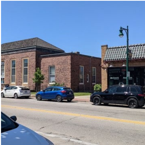
iii. The lot on the right defers to the historic post office by giving a wide berth with generous side setback and by limiting its height. It also uses brick, a defining feature of buildings in the area.