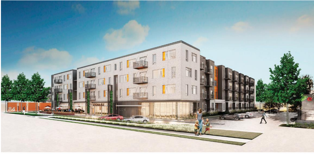
EXHIBIT B - "Development Plan"