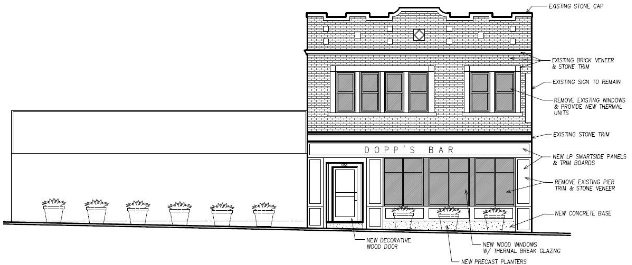
proposed front elevation

As previously stated, no architectural improvements are proposed on the left/south section of the building at this time. However, at minimum, staff is recommending that a fresh coat of paint be applied to clean up the appearance after construction; details to be provided.