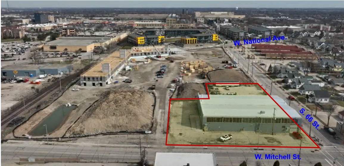
Street view - 454-0254-002 | 6604-6620 W MITCHELL ST