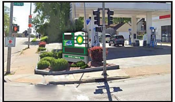
E Placement View

A summary of the signage proposal follows: