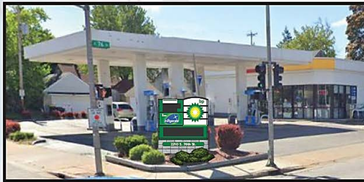
SE Placement View

locational appeals previously and for other gas stations with similar challenges. The last example was at the corner of S. 60 St. and W. National Ave.