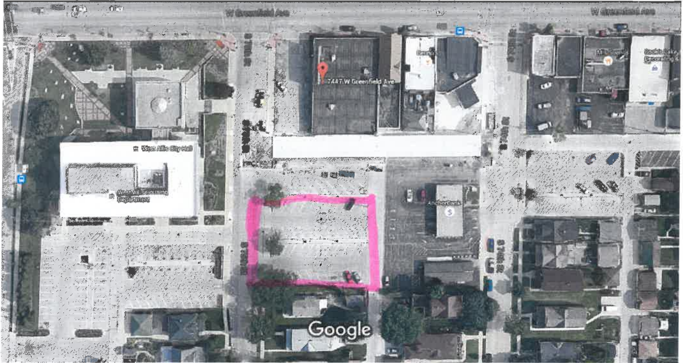
Imagery ©2016 Google, Map data ©2016 Google 50 ft