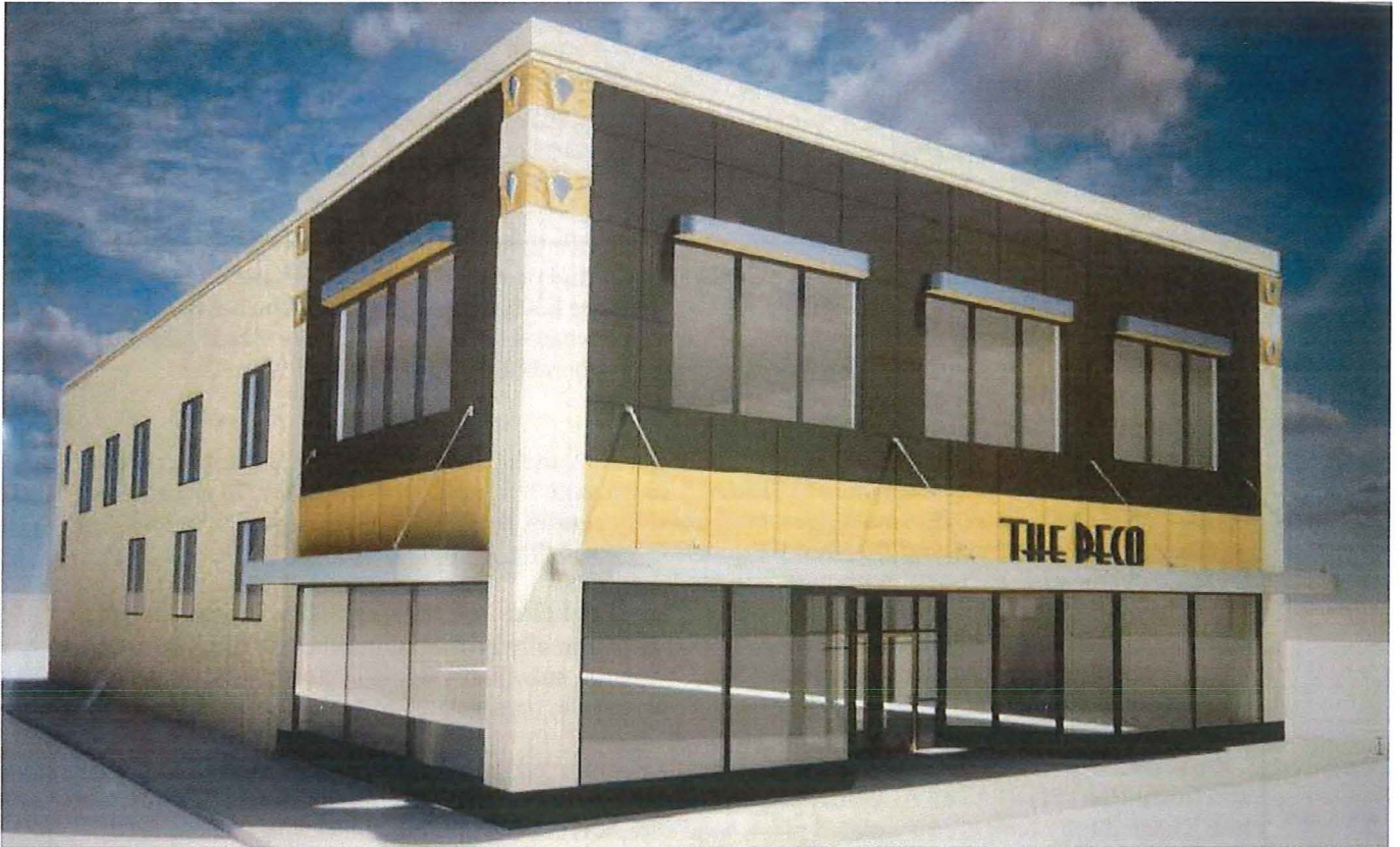
Exhibit D – Architectural Plans